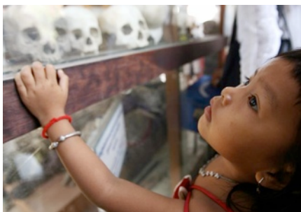
A Cambodian girl looks at skulls on display at the Choeung Ek killing fields memorial in Phnom Penh. Hundreds of survivors of the brutal Khmer Rouge gathered in 2009 at Cambodia's notorious killing fields.

In their quest for a new national order, the Khmer Rouge conducted deadly purges to eliminate all remnants of "old society"—from Buddhist monks to doctors to the children of former government officials. Executions were frequently arbitrary—people with eyeglasses or larger stomachs were targeted for their perceived connections to the intellectual class or the former government. By the Khmer Rouge's fall in 1979, it is estimated that as many as 3 million people—over 1/3 of the entire population—died from starvation, disease, overwork or summary execution.