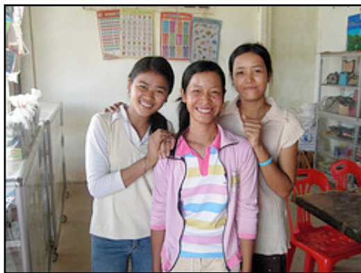
These three young women used their business development fund to start a print and stationary service.

Dining for Women's donations will fund the salaries of two shelter-based counselors and two social workers, travel and incidentals for repatriated victims, the cost of establishing five local women’s support groups, and financial assistance and small business grants for approximately 70 reintegrated victims.