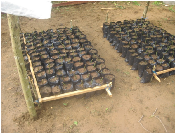
Black and white pepper nurseries in the community garden in Bangang.