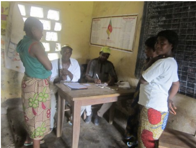
Women participants registering to receive oil palm plants to start commercial production