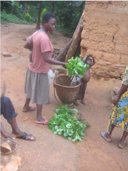
Washing greens from the community garden in Folepi.