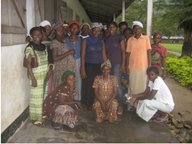
Business class participants from the villages of Folepi and Bechati