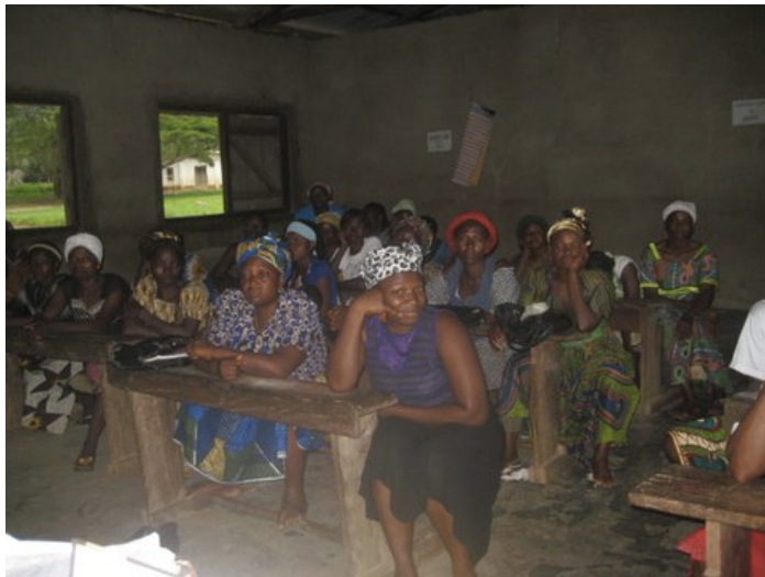
Business class with participants from the villages of Folepi and Bechati