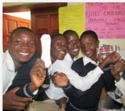
Students at Bukooli College High School show off their product: homemade, reusable sanitary pads.

Students from the mixed-gender school Bukooli College were selected to participate in the National Business Club Competition this year for their innovative project manufacturing reusable sanitary pads. The project was developed by a Scholar named