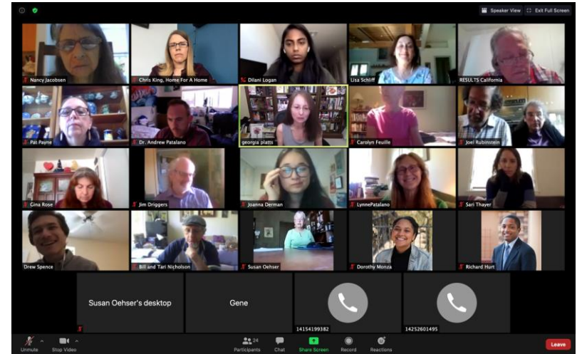
DFW & Results meeting with Senator Harris' Staff