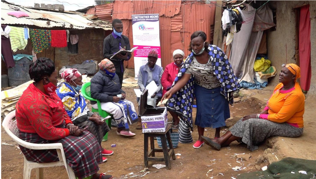
Global Fund for Widows - Kenya DFW October Grantee

Global Fund for Widows delivered an insightful intervention in its continuing exposure of the institutionalized and systemic violations of human rights endured by widows across the globe and the direct link of widowhood to poverty.