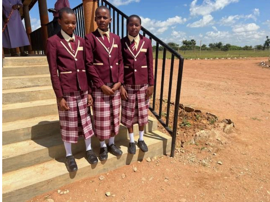
3 of the 4 new scholars at Mother Marie Eugenie