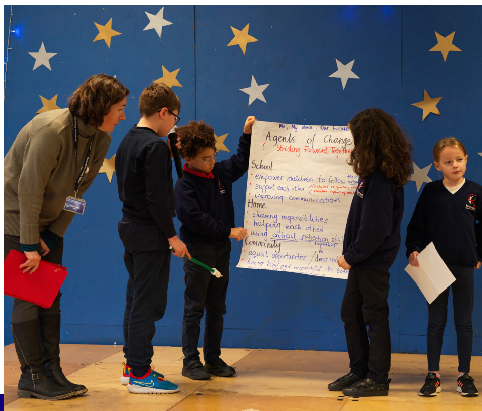
Participants engage in the GBI curriculum with our partners, Lifting Limits, at the Ravenstone Primary School in the UK

Our participation in WOW Fest (Women of the World) hosted by the WOW Foundation in London marked another highlight. WOW Fest is a platform that celebrates women and girls and looks at obstacles faced by women and girls globally. Over 2,000 people engaged with our content and discussions about the importance of involving young boys in conversations around gender equality, including taking home conversation starters to facilitate these discussions. Our GBI programs continue to deepen the work in the Americas, Europe, and Asia, generating tip sheets, reports, and the latest research on boys' development and their emotional and social growth for educators, parents, NGO practitioners, and media.