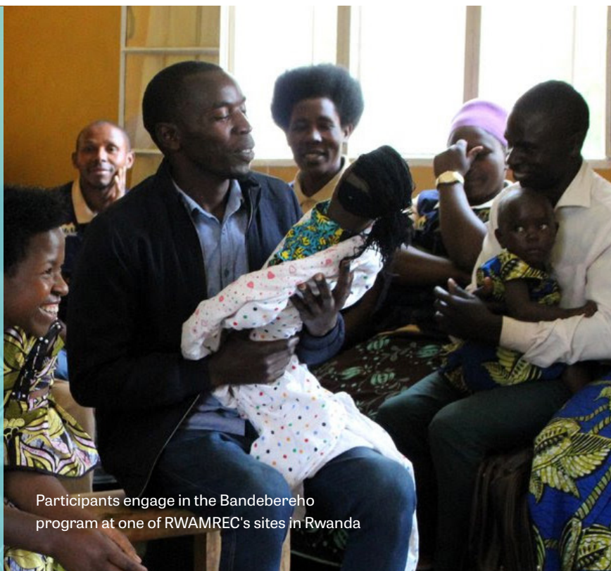
Participants engage in the Bandebereho program at one of RWAMREC's sites in Rwanda